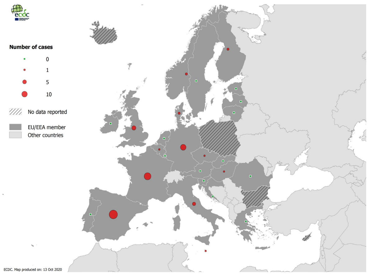
Figure 1. Distribution of Zika virus disease cases by country, EU/EEA, 2019

For 2019, the number of ZIKV disease cases reported by the EU/EEA countries has increased compared to 2018, but with a lower notification rate than 2016 (0.6 per 100 000) and 2017 (0.1 per 100 000). Two peaks in reporting were noted between April and May (n=17), representing 24% of cases, and between August and September 2019 (n=22), representing 31% of cases.